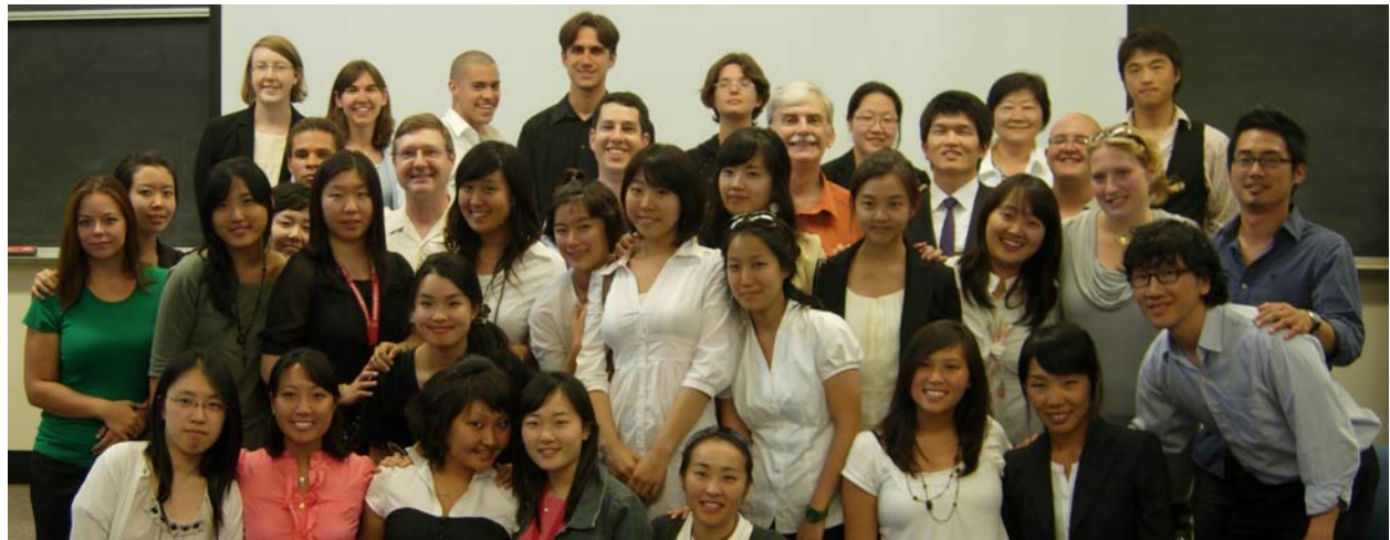
The delegates of the first annual Korea America Student Conference gather with guest speakers for a group photo in the IEAS Conference Room. The conference was co-hosted by four American universities, including UC Berkeley, in July 2008. Student delegates from both countries attended the program, which will be held again next year in Korea.

CENTER FOR KOREAN STUDIES 2223 Fulton Street, Room 508 University of California Berkeley, CA 94710-2318 Tel: (510) 642-5674 / Fax: (510) 643-9787 http://ieas.berkeley.edu/cks